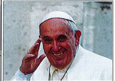
Pope Francis, we pray for you!

THANK YOU FOR YOUR SUPPORT DURING THE CHRISTMAS SEASON!