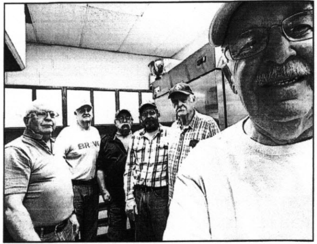
BEST TEAM EVER! Thanks to you we made it happen!