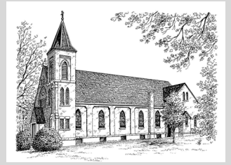
ST. DOMINIC CHURCH Located at: 97 West Main Street Shortsville, NY 14548