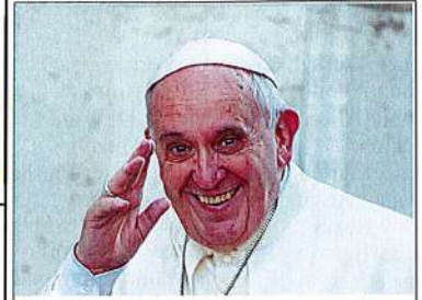
Pope Francis, we pray for you!

THANK YOU FOR YOUR SUPPORT DURING THE CHRISTMAS SEASON!