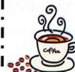
St. John Bosco Schools

St. John Bosco Schools 501 Garfield St. East Rochester, NY 14445 585-348-9401