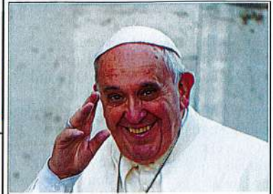
Pope Francis, we pray for you!

THANK YOU FOR YOUR SUPPORT DURING THE CHRISTMAS SEASON!